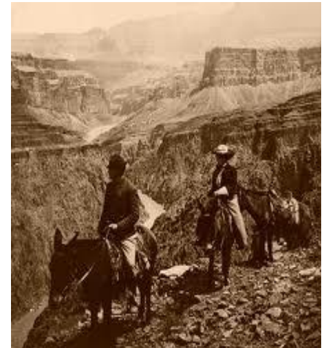
Grandview Trail 1906, notice the long ears..